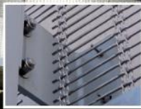
Wire Mesh Building Envelope, Aurora GO Transit Station, Aurora, Ontario NORR Limited, Architects, Engineers, Planners